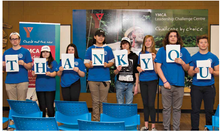
Youth who participated in the exciting Project North program had a great opportunity to forge new friendships and be part of a unique experience.

NOVA Chemicals and the YMCA share the belief that building healthy communities can start with inspiring and engaging youth. It's important to us at NOVA Chemicals to develop and sustain healthy communities where we live and work and partnering with the YMCA is a great way to do that.